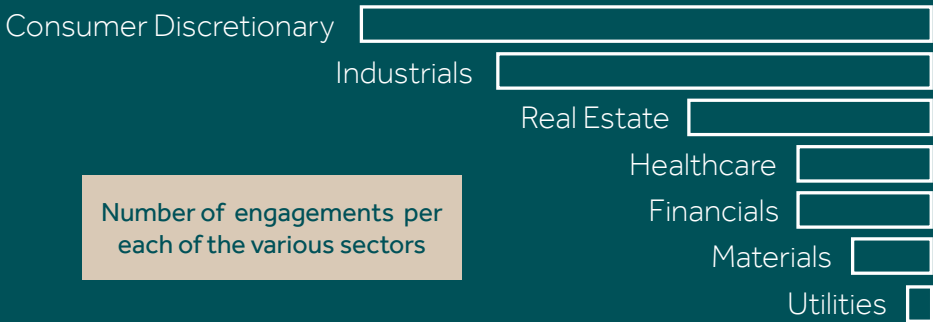
Number of engagements per each of the various sectors

Various types of engagements which occurred over last 12 months