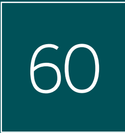
Total engagements over last 12 months